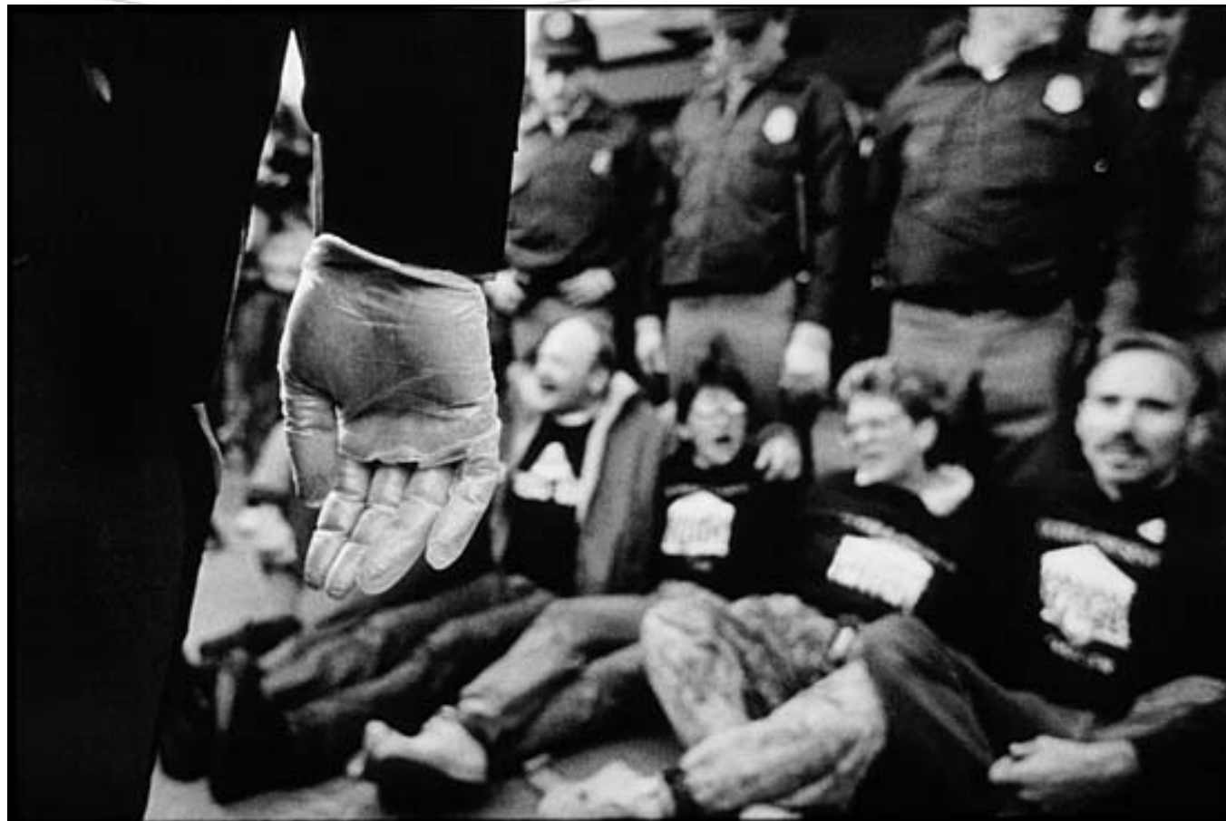
Act Up members block the entrance to the Food and Drug Administration building, October, 1988.